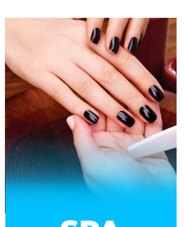
SPA Meet, relax and de-stress!